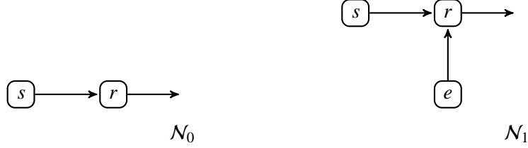
Table 9 A simple topology for a network

Intuitively, since \Gamma \vdash_t = n , the transmission of value v in \Gamma \triangleright c!!\langle v \rangle.P can take place only after at least n instants of time. The same happens in \Gamma \triangleright \sigma^k.c!!\langle v \rangle.P .